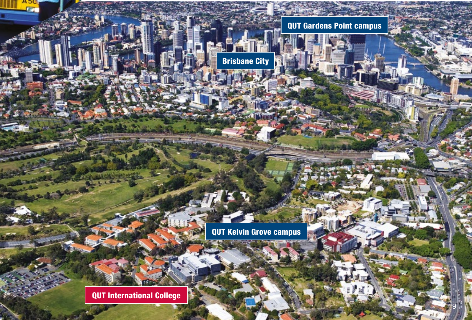
QUT Gardens Point campus