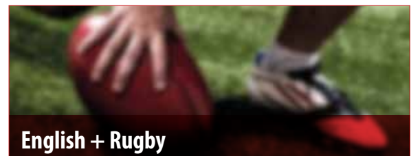
English + Rugby