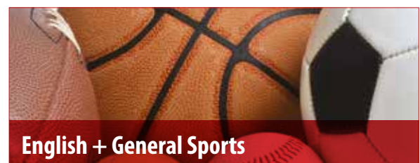
English + General Sports