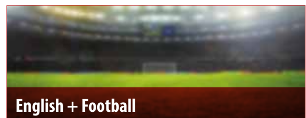
English + Football