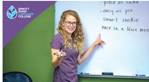
Vancouver Howe Campus 12, 582 sq ft (1169 sq m)