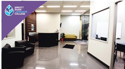
Vancouver Melville Campus 4, 665 sq ft (433 sq m)