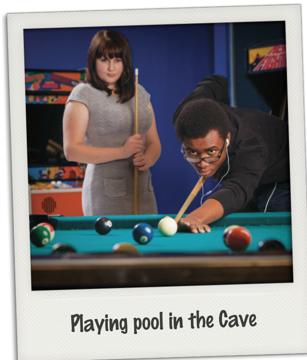
Playing pool in the Cave

LA Shuttle provides direct shuttle service from the Calgary International Airport to your desired destination in Lethbridge. One-way cost from Calgary to Lethbridge is approximately $65.00. For more information or to book a pick-up, please visit: lashuttle.net .