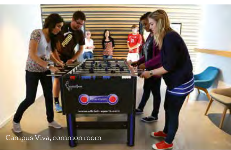
Campus Viva, common room