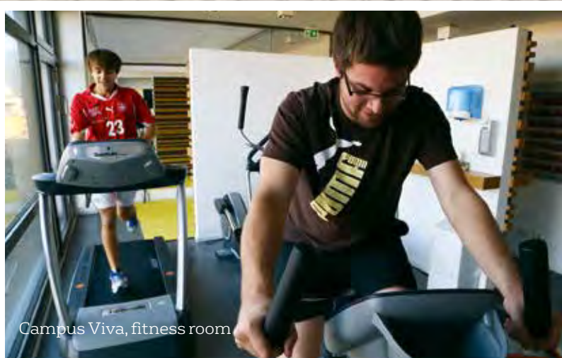
Campus Viva, fitness room