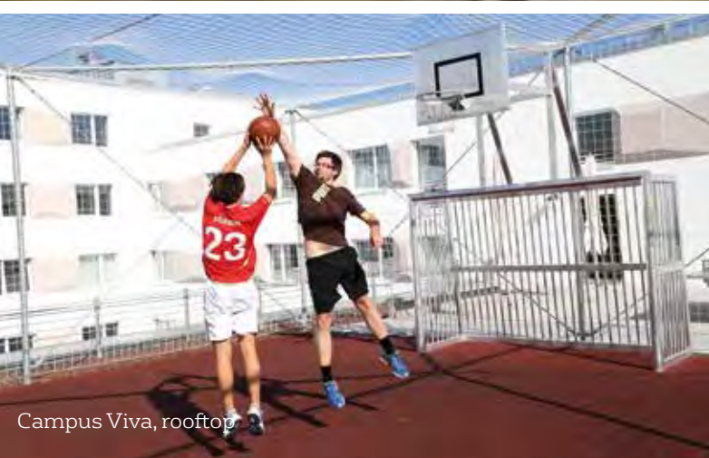
Campus Viva, rooftop