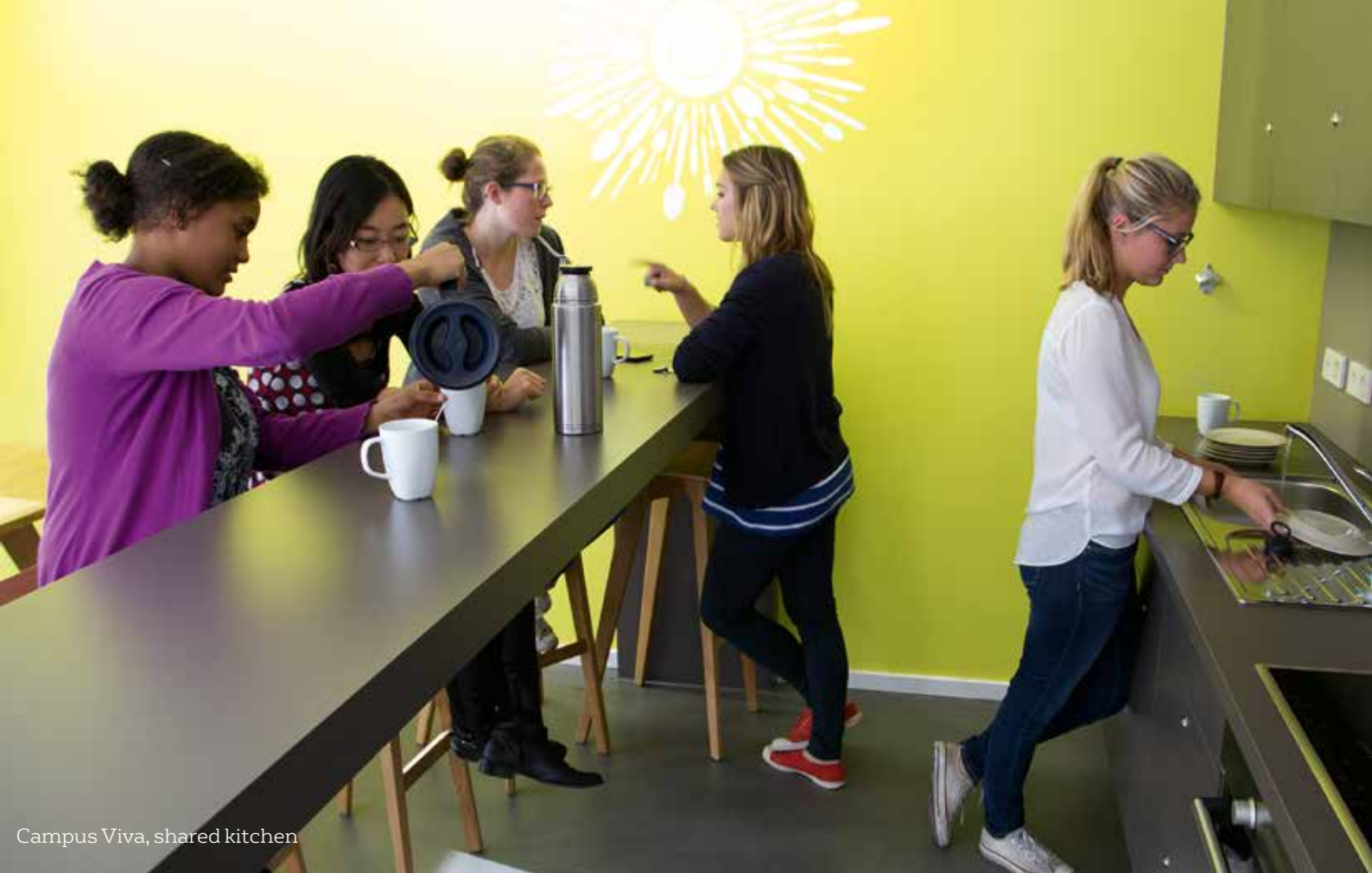
Campus Viva, shared kitchen