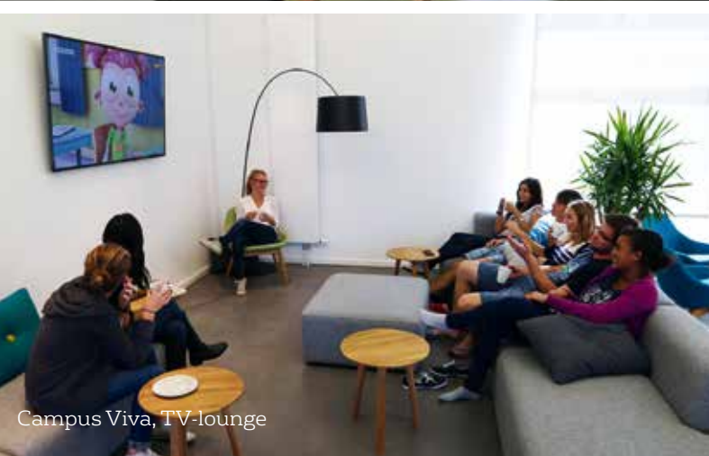
Campus Viva, TV-lounge