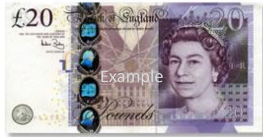
Twenty pounds (£20)