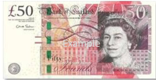
Fifty pounds (£50)

There is no restriction on the amount of money that you can bring into the UK. Please do not carry large amounts of cash - it is much safer to use a debit card or credit card. You will need to bring some cash for your journey and for the first one or two days. You can change money at your port or airport of arrival, or at banks, post offices and travel agencies in England.