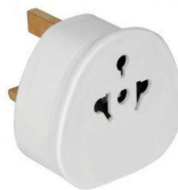
Mains electrical adaptor