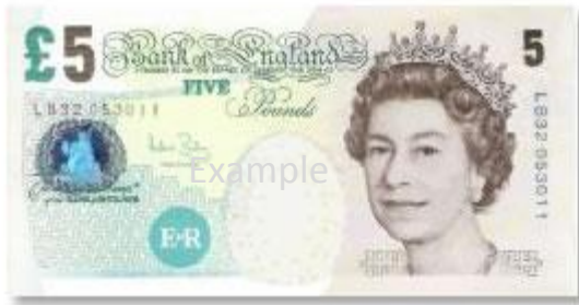
Five pounds (£5)