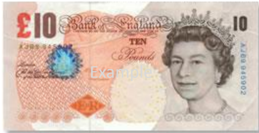
Ten pounds (£10)