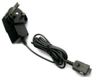
Mobile phone charger