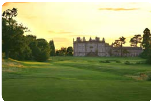
Golf at Dalmahoy