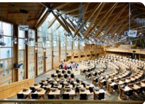
Parliament Debating Chamber