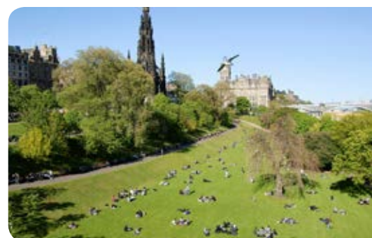
Princes Street Gardens