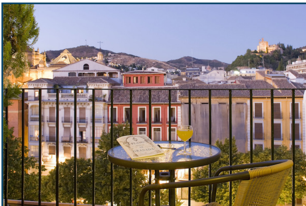
Hotel Los Tilos