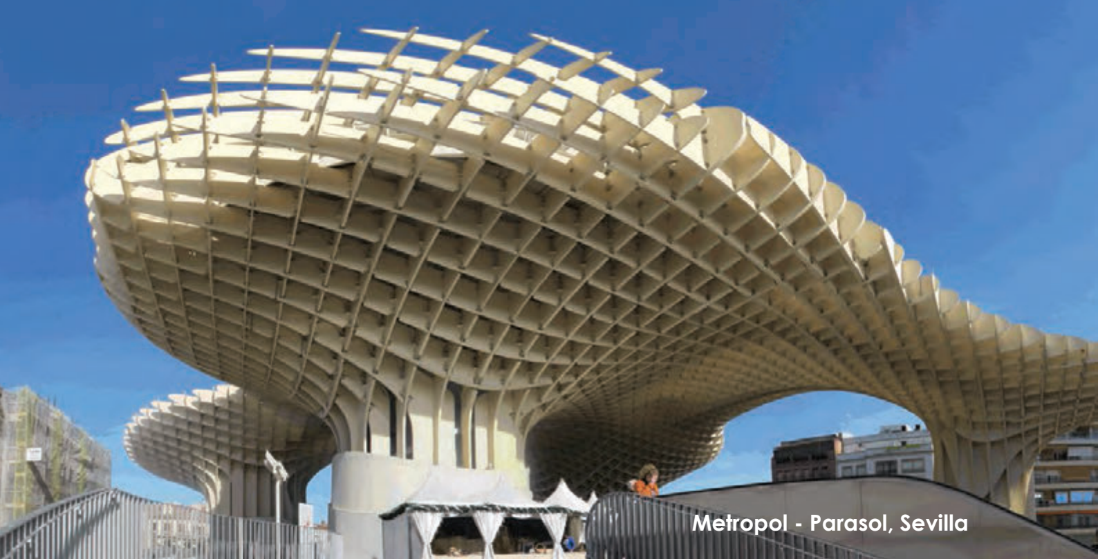
Metropol - Parasol, Sevilla