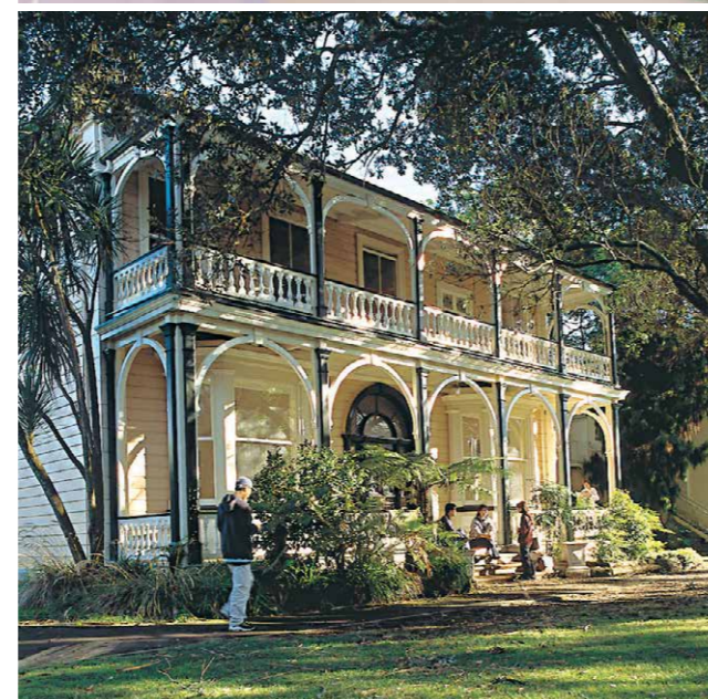
29 Princes Street