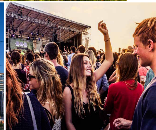
Above: Laneway Music Festival at Silo Park, Wynyard Quarter - central city waterfront. Left: Viaduct Harbour, Auckland city.