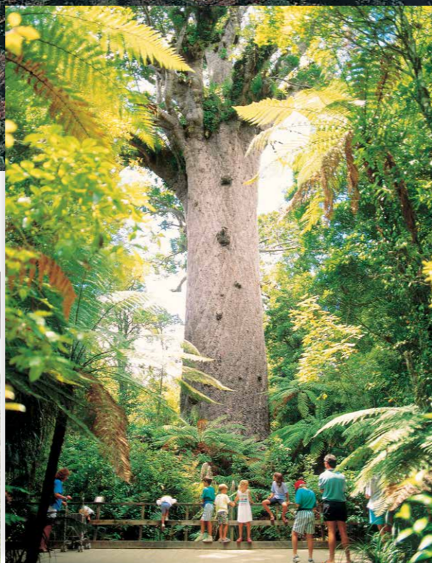
Attractions near Auckland. Above: Waipoua Kauri Forest, Northland. Left: Hobbiton, Matamata.