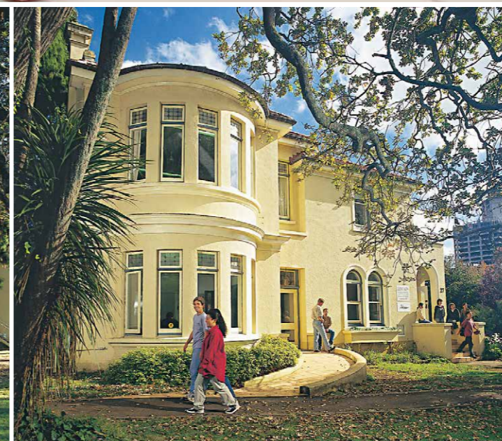
27 Princes Street