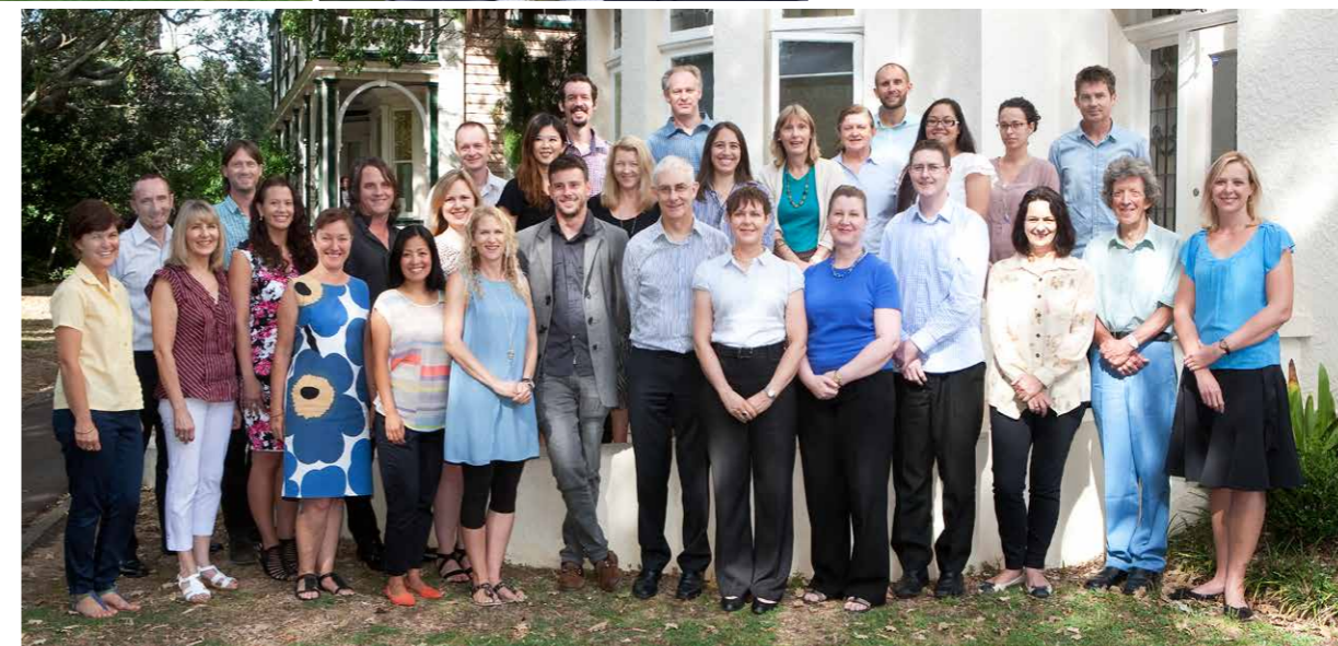
Languages International staff.