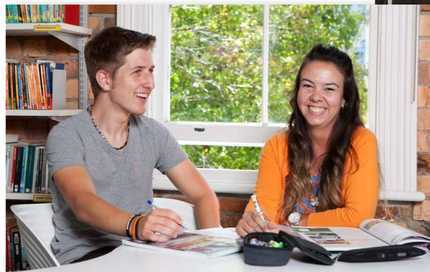
Above and right: In the Learning Centre, you study independently, with a teacher and with other students.